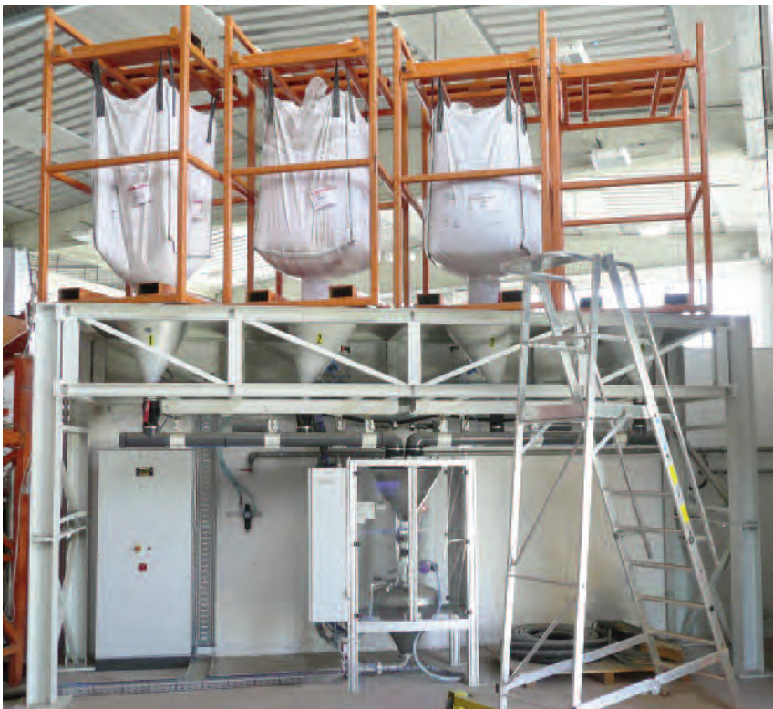
▲ COM 70-1 Granule metering system with one conveying vessel for 4 colors in 2 mixers with one electronic weigh hopper

From the weigh hopper the color batch can be discharged in up to 6 pressure vessels. These pressure vessels serve as holding hoppers for the preweighed batches which can be discharged immediately to the mixer on demand while another weighing process is carried out. The color batch is conveyed directly to the mixer fitted with dust collector or to filter cyclone.