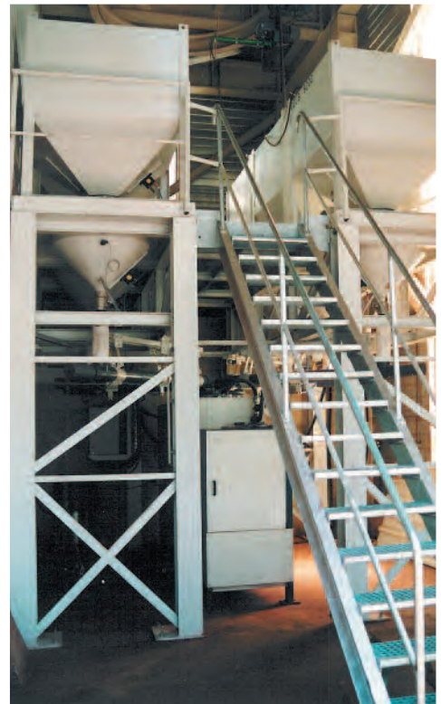
COM 70-3 Granule Metering System with 3 pressure vessels for 6 colors in 3 mixers. Low profile design with tote bins GC 1500