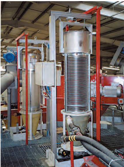
▲ CF 40-S filter cyclone with electronic load cell and easy to clean filter element

It is also possible to convey into a filter cyclone mounted above the mixer. This is necessary if the mixers are not sealed or for quick discharge. The filter cyclone is fitted with air shock, flexible holding hopper and easy to clean filter elements, optionally it can be fitted as scale CF 40-S for weight check.