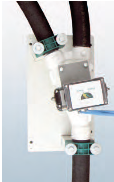
▲ Pneumatic diverter