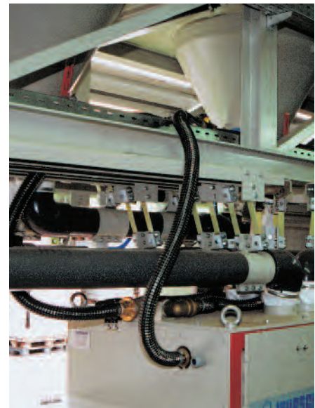
▲ Detailed view of vibrating pipes for coarse/fine metering of color Granules