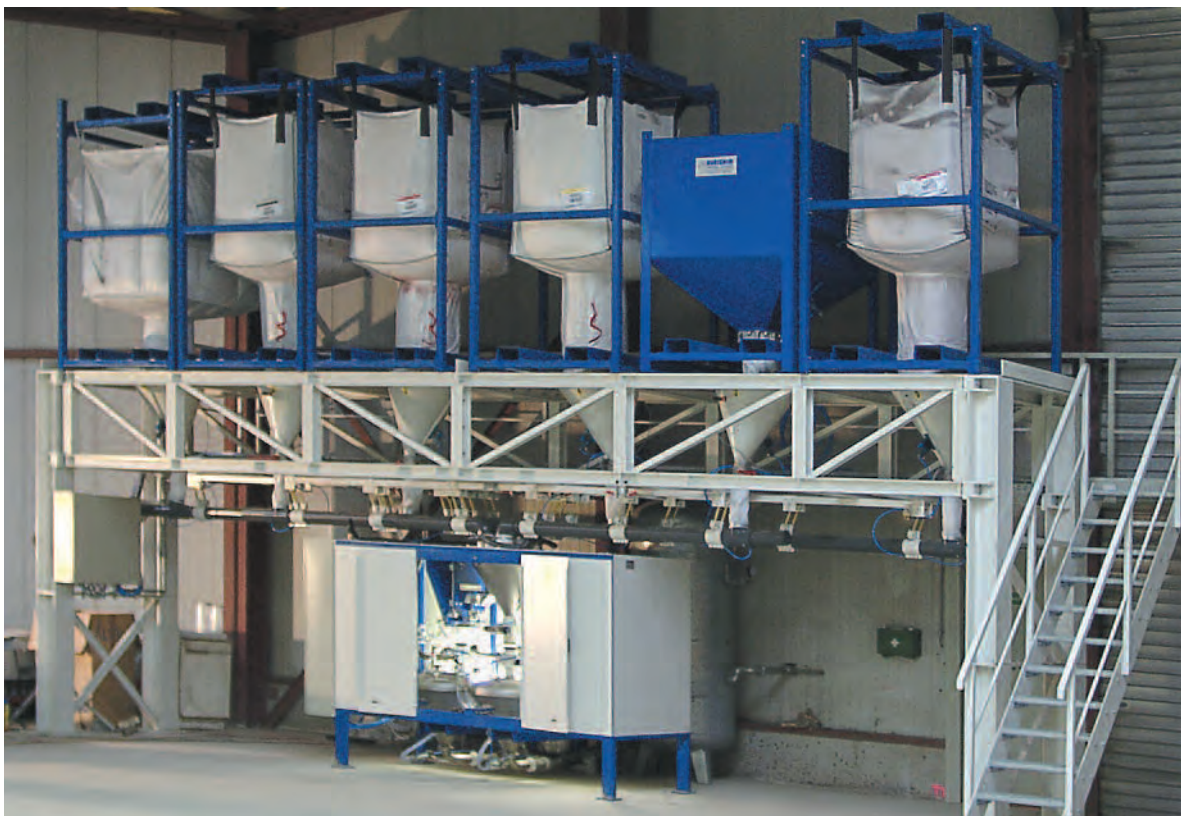
▲ COM 70-3 Granule metering system with three conveying vessels for 6 colors in 3 mixers with one electronic weigh hopper